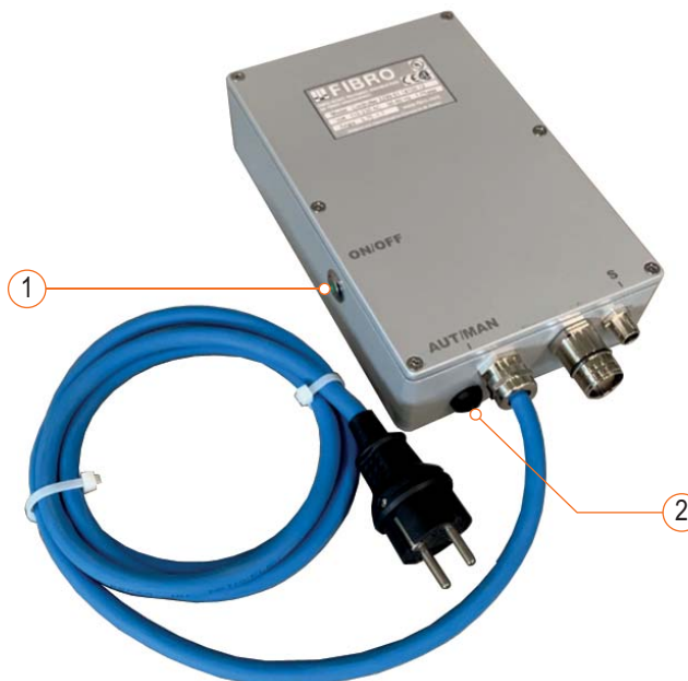
Fig. 6-1 Operating elements of control unit CLEAN LINE