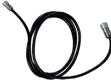
Fig. 3-4 Connection cable

The connection cable connects the control unit to an electrical transporter.