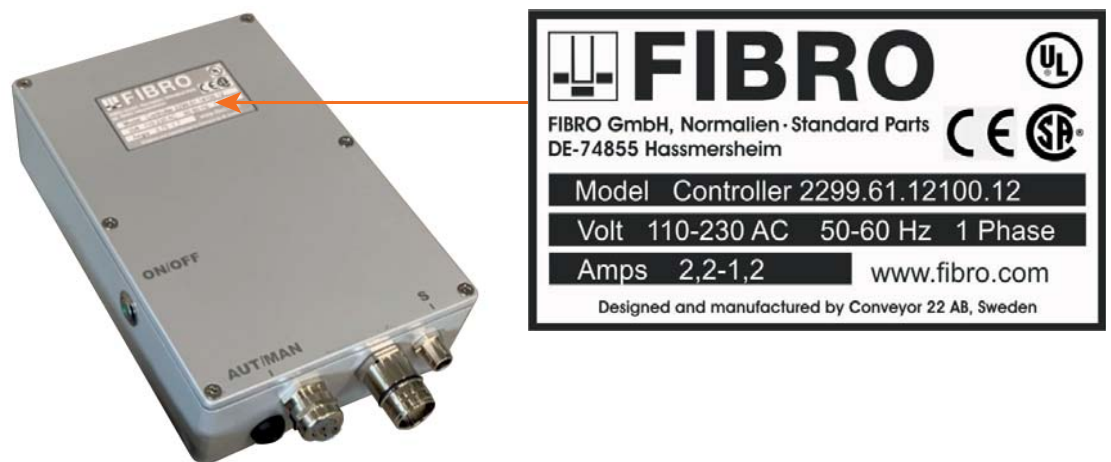
Fig. 3-3 Type plate

A type plate is attached to the control unit. The information on the type plate must be provided for all questions and orders.