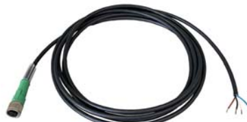
Fig. 3-5 Signal cable

The signal cable connects the control unit to an external device.