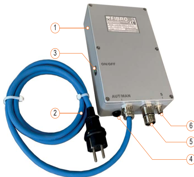
Fig. 3-1 Components of control unit CLEAN LINE