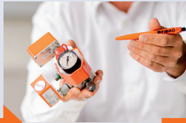
Product development from initial sample to final product