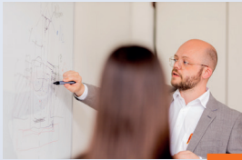
Concept and design support

Based on technical drawings, data and specifications, we support you with the application-specific construction of your individual solution and manufacture to the highest production standards to meet your requirements.