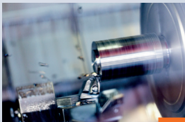
Series manufacturing at the highest level with customer-specific labeling and packaging