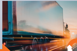
Reliable customer service and delivery, including "just-in-time"