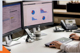
Continuous communication with our experts